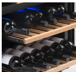
44-46 wine bottle capacity (750ml)