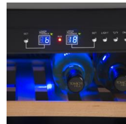
Computerized temperature control